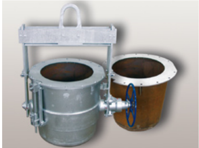
The new ladle type: pouring ladle body with replaceable insert ladle

In addition, the new ladle type is characterized by the following features: