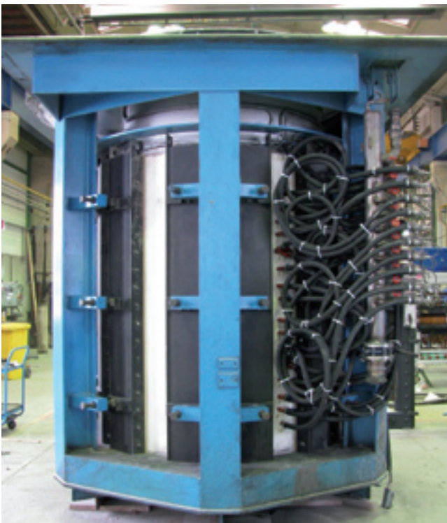
Coreless induction furnace retrofitted with energy-saving coil

The coil losses (ohmic loss) produced by the coil current vary between 20 and 40 %, depending on the charge material. This electrical energy needs to be removed from the induction coil by intense cooling and cannot be put to use in the melting process itself. The most promising approach for achieving further energy savings, therefore, is to go for this unproductive potential.