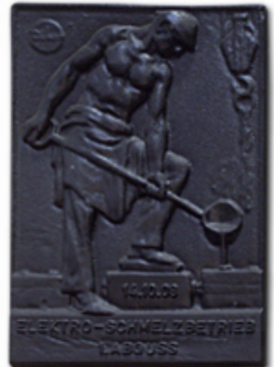
Cast remembrance badge

Dietmar Trauzeddel (Tel. +49 2473 601 342)