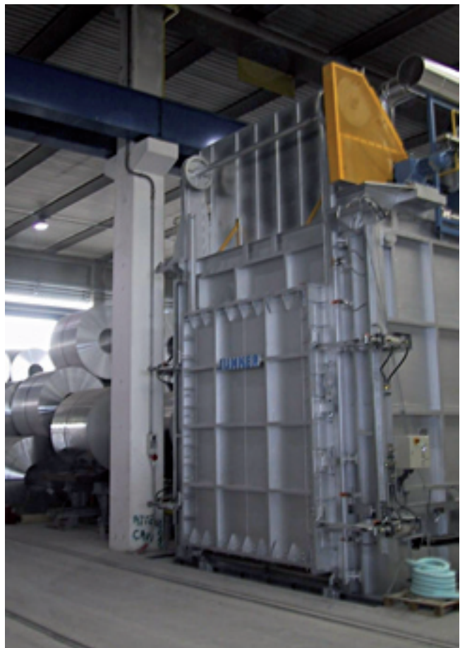
Chamber furnace for strip coils