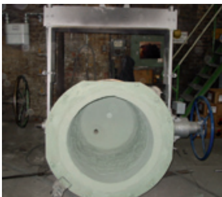
Double-walled pouring ladle ready for operation