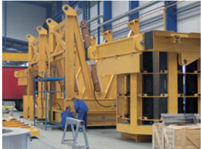
The 40-tonne furnaces under shop assembly

A water re-cooling system relying on OTTO JUNKER's patented freeze-proof, glycol-free air cooler technology forms part of the complete melting installation. At outdoor temperatures over 30 °C, water will be cooled down to the required return line temperature via an additional plate-type heat exchanger using industrial water.