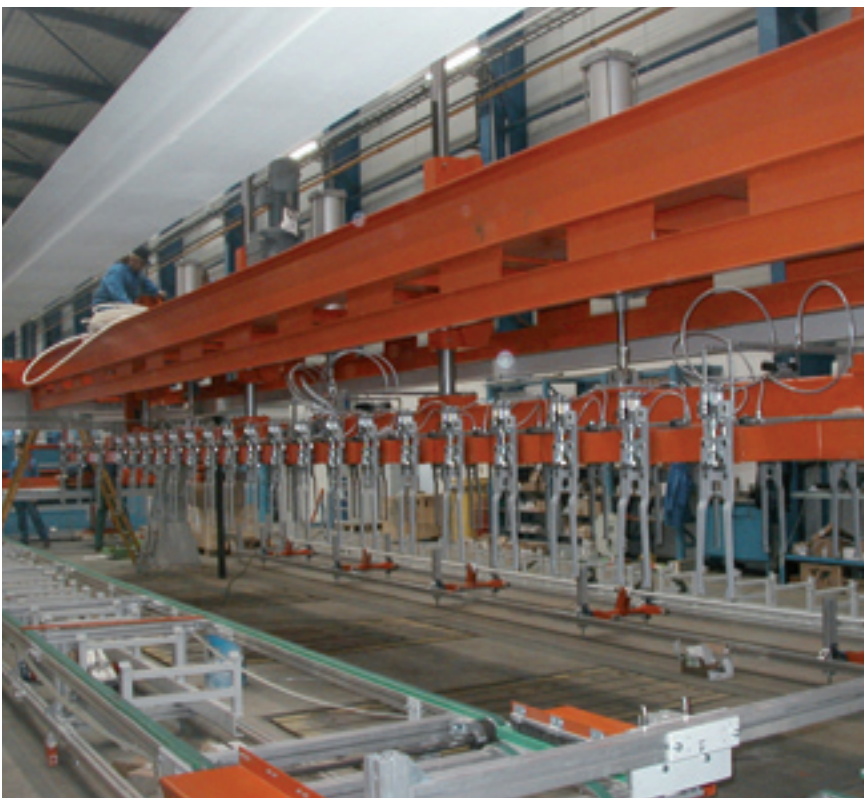
Shop assembly of a 16.5 m stacker of improved ELHAUS design