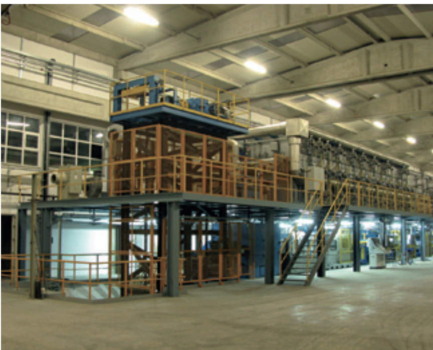
Continuous strip annealing line of double-deck design