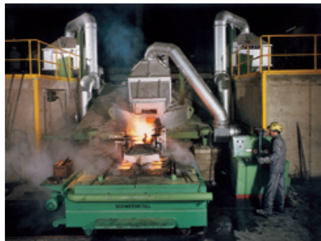
Schwermetall Stolberg: Melting and pouring by means of coreless induction furnaces

Much has been done in recent years to optimize the energy consumption of the company's machinery and equipment (e.g., melting furnaces, walking-beam furnace). Some older installations have been equipped with computer control technology, and idling times have been minimized throughout. In the ongoing quest for further savings, a further potential was tapped in cooperation with OTTO JUNKER. ▶ ▶ ▶